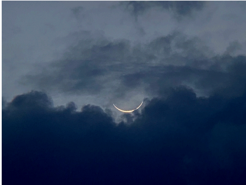
18 April 2026 New Moon, from Spain (MA)