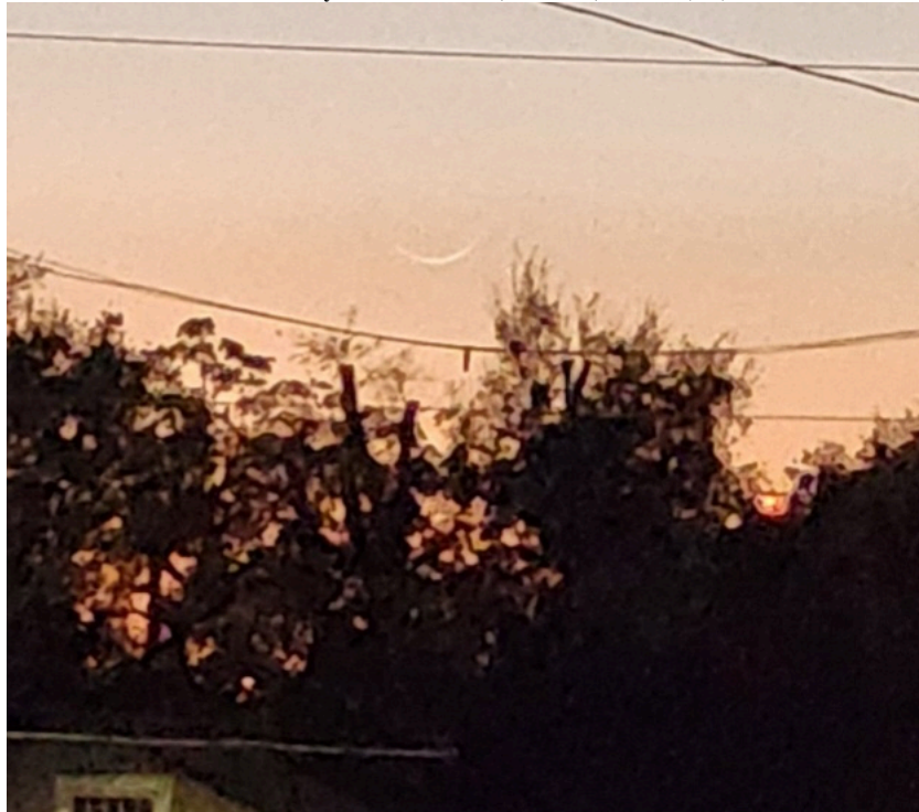
28 February New Moon, Blacksburg, Virginia (JT)