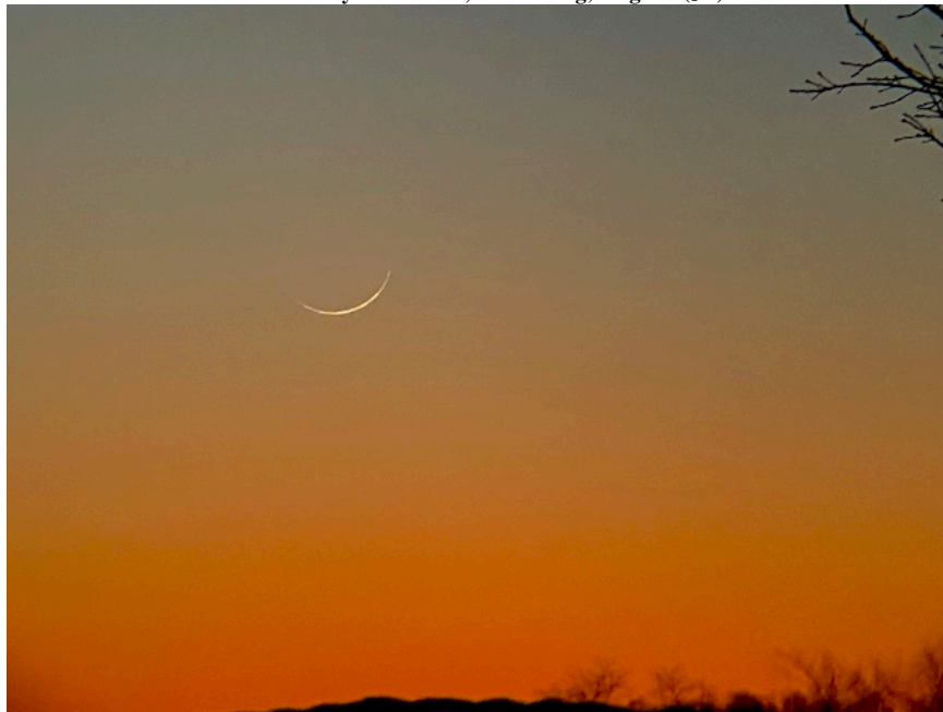
28 February New Moon, Tempe, Arizona (MP)