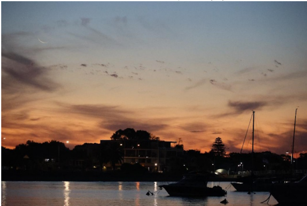
12 Jan 2024 New Moon, Houston, Texas (BW)